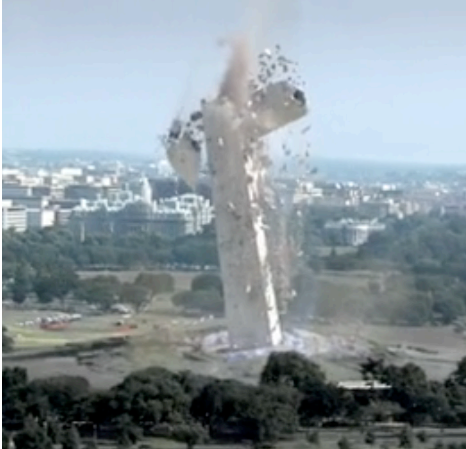
Fictional depiction of a supernatural catastrophe destroying the Washington monument – from The Event (2010).

Another structure hard hit by this quake, and numerous aftershocks over the next few days, was the equally pagan Washington cathedral, designed and built to mock the true faith by paying homage to all the world's pagan religions, particularly the secret occult religion of Lucifer (satan the devil), otherwise known as the great deceiver, the adversary, and the dragon whose spirit will possess the coming beast world dictator!